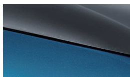
Surfing blue + Urban grey