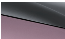
Coral pink + Urban grey