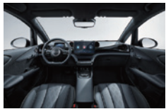
Black and grey