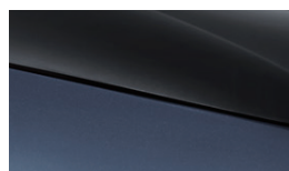
Atlantis grey + Jet black