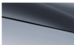
Skiing white + Urban grey